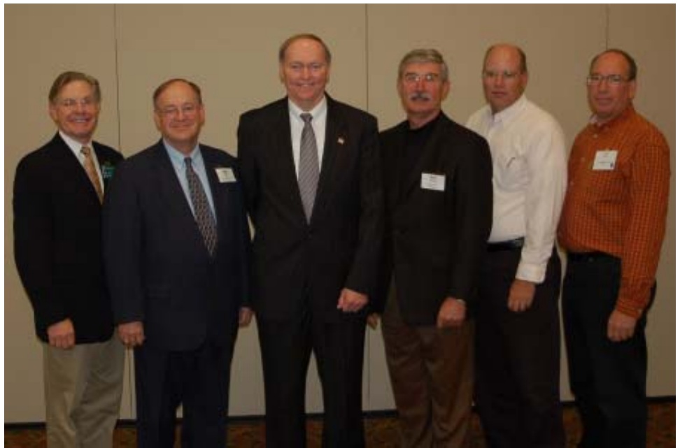
New ISPFMRA Leadership Team